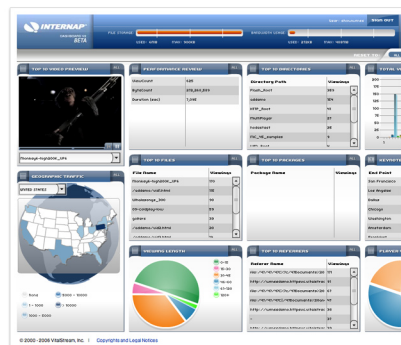
The live streaming service for Flash enables you to capture and stream your live events over the Internet.